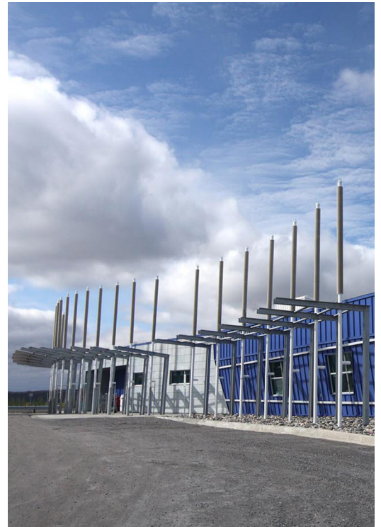
Kuujjuaq Airport Terminal, Kuujjuaq, Nunavik (QC)