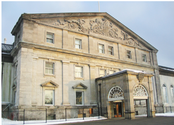
Rideau Hall, Ottawa (ON)