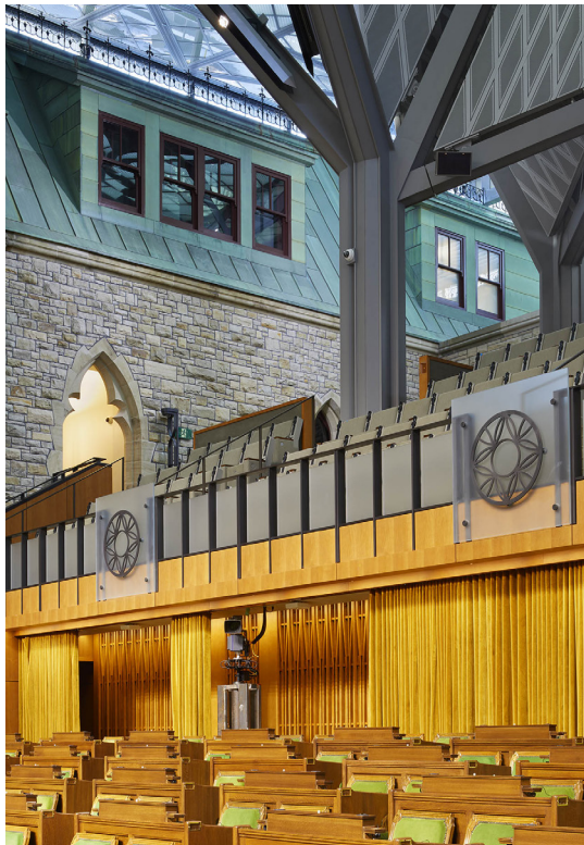
West Block, Parliament of Canada, Ottawa (ON) In consortium with A49