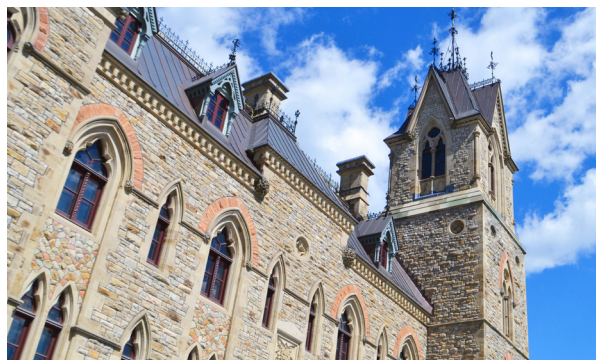
West Block, Parliament of Canada, Ottawa (ON) In consortium with A49