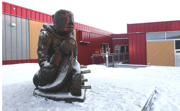
Youth Rehabilitation Centre for Girls, Inukjuak, Nunavik (QC) In consortium with CGA