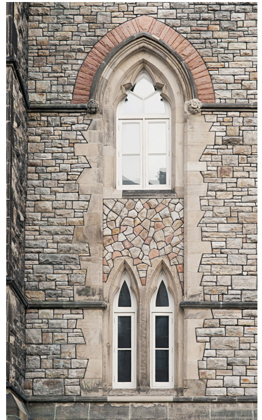
West Block, Parliament of Canada, Ottawa (ON) In consortium with A49