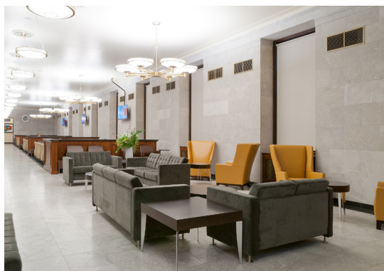
Union Station, Toronto (ON)