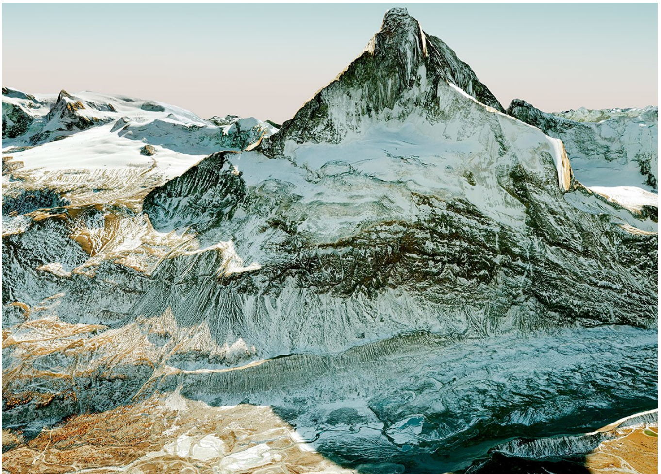
Your earth transforms, Meike Nixdorf

In order to achieve its goals, Art Souterrain relies on a strong model that consists in bringing art out of traditional exhibition spaces in order to bring it to meet individuals. By investing in unconventional places, the organization wants to surprise everyone in their daily lives and thus provoke an interaction of a new kind.