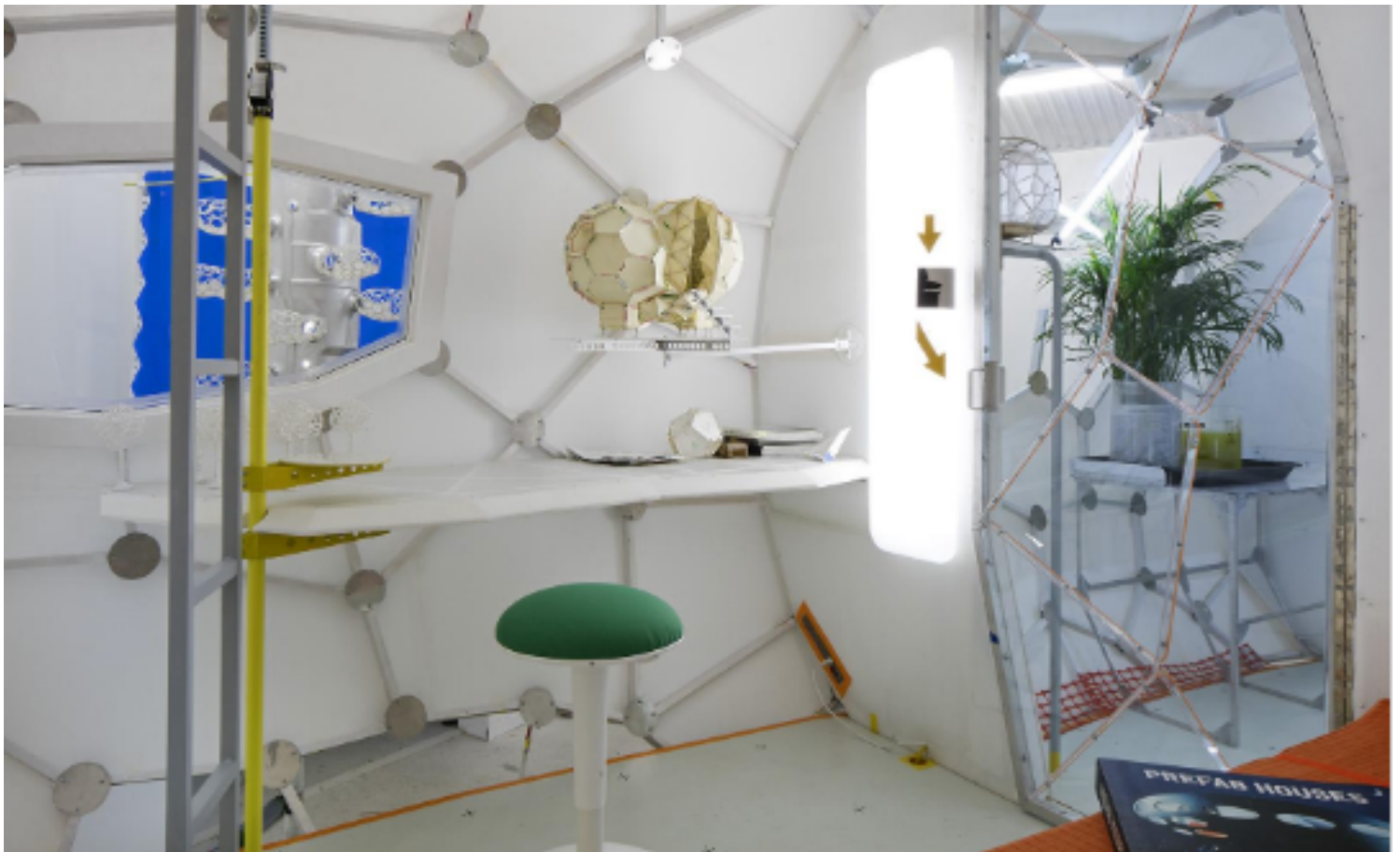
Module de survie, Daniel Corbeil