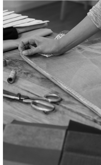
UNIFORMS BY PHILIPPE DUBUC AND MARIE SAINT PIERRE

The photographer plays with transparencies to create sixties-inspired works invoking vertical movement. Cylinders and coloured discs punctuate the style of the new rooms. “I started with sketches and then did Photoshop renderings. It’s a project of colours,” explains the artist. “The artwork is actually a photo. I cut and painted logs and glued them onto a sheet of plexiglass. Then I took a slow-exposure photo on a moving vertical axis to create the transparent effect.”