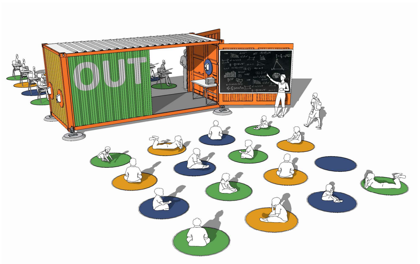
IMAGE 1 - PERSPECTIVE 1

Healthy building ventilation is provided either mechanically with fresh air supply systems that are integral with the building HVAC system, and/or windows that provide a continuous cross flow of outside air. In older schools, mechanical systems and windows that provide a comfortable and healthy cross breeze are very often lacking. Unfortunately, upgrading systems and buildings to provide adequate fresh air carries great cost and takes considerable time.