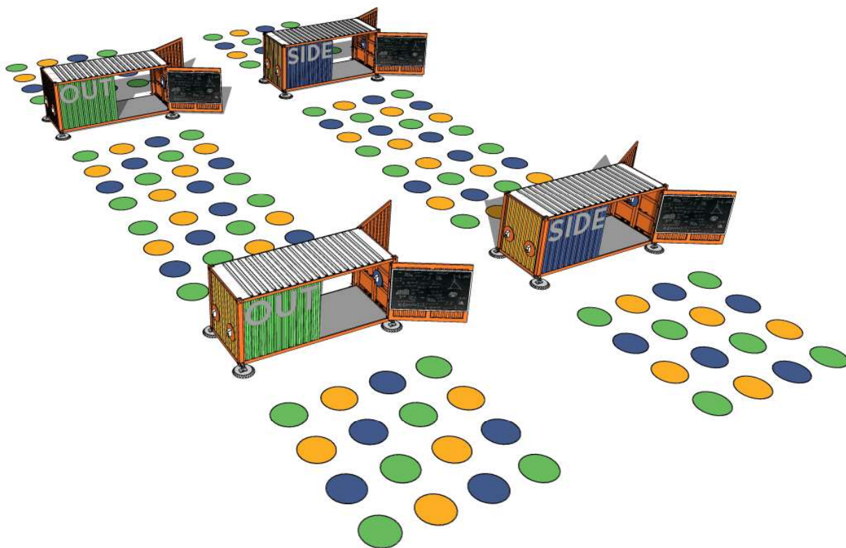
IMAGE 2 - BIRDS EYE

OUTSIDE the Box is a simple, historically proven response to the COVID 19 pandemic. It provides a practical and alternate solution for facilities where the interior environments may not be able to provide the indoor air quality needed. Its durable design will continue to provide support for healthy outdoor, fresh air teaching and learning long past the end of this pandemic.