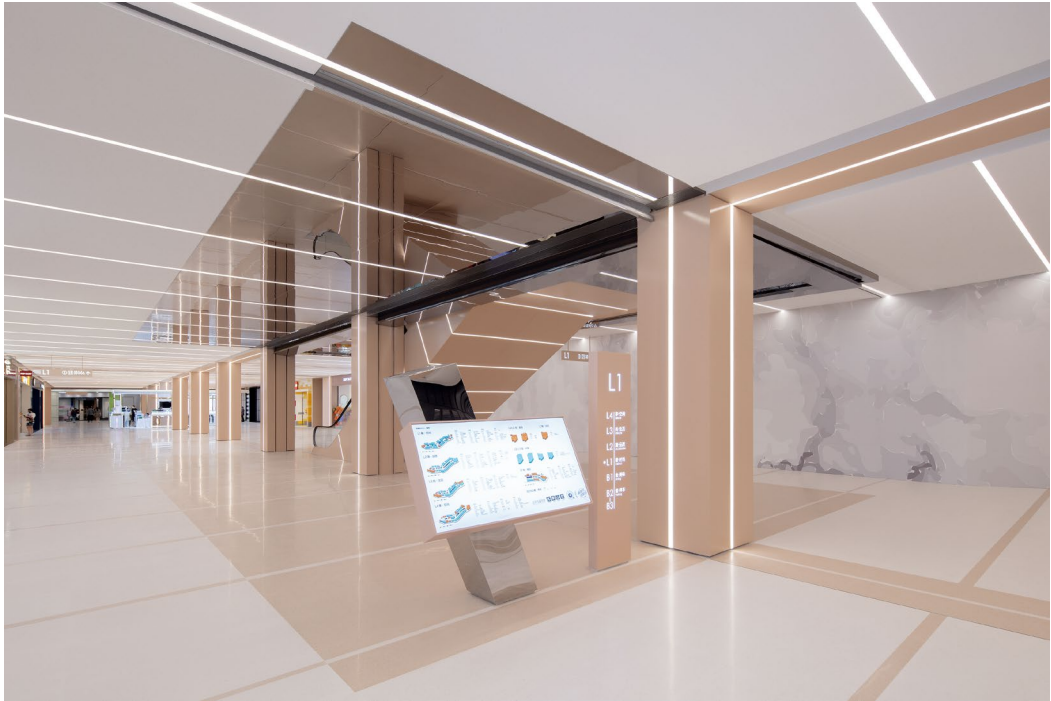
a contemporary three-dimensional network of luminous rays

The original atrium could not be drastically changed due to structural constraints, CLOU started from the existing central columns by adopting a strategy of highlighting and strengthening the column network. A linear 'light grid' connects structural columns and ceilings into a contemporary three-dimensional network of luminous rays, dissolving the abrupt column and stuffy horizontal space in the original building. Combining the existing structures and the art of lighting provides customers with a modern shopping experience that moves with the lights.