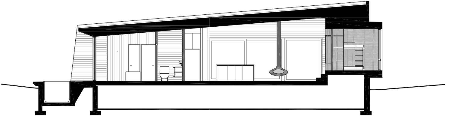
SECTION 1 scale : \frac{3}{32}'' = 1'-0''