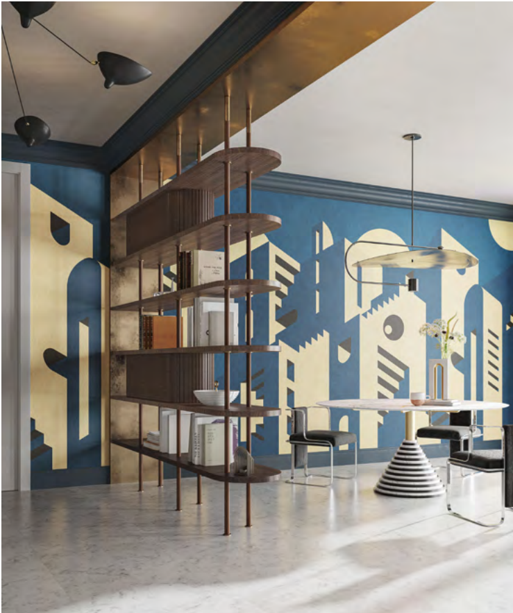
Metropolis collection by LAToxLATO

JUNE 2023 - LAToxLATO makes its debut in wallpaper design by collaborating for the first time with Inkiostro Bianco, an Italian brand specializing in decorative coverings that bridge art, architecture, and design. The result is a series of evocative metaphysical wallpapers. Urban visions that envelop spaces in a rarefied, dreamlike, and yet dynamic dimension.