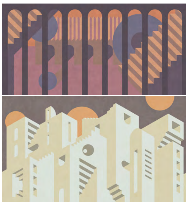
Four designs created by LATOxLATO, within the Flow line

It's an original interpretation and contribution to Inkiostro Bianco's Flow line, characterized by fluidity, the rhythm of shapes and colors, to break boundaries and rigidity that often compress us in today's life. "We are thrilled about this collaboration with a company like Inkiostro Bianco, an authentic laboratory of ideas that has given us full confidence and great creative freedom. It is as if we have been able to paint our vision on a blank canvas. On whatever scale we work, from the building to the furniture complement and now the wallpaper, we love to combine the architectural sign with a metaphysical atmosphere," tell Virginia Valentini and Francesco Breganze de Capnist , founders of LATOxLATO.