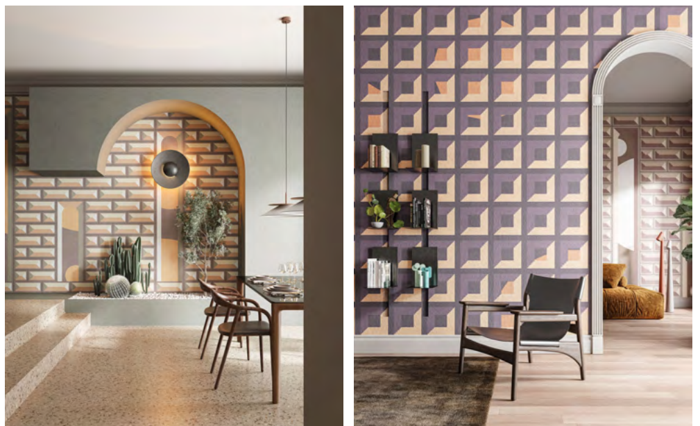
Bossage and Coffer Mania collections, part of the Flow line

JUNE 2023 - LAToxLATO makes its debut in wallpaper design by collaborating for the first time with Inkiostro Bianco, an Italian brand specializing in decorative coverings that bridge art, architecture, and design. The result is a series of evocative metaphysical wallpapers. Urban visions that envelop spaces in a rarefied, dreamlike, and yet dynamic dimension.