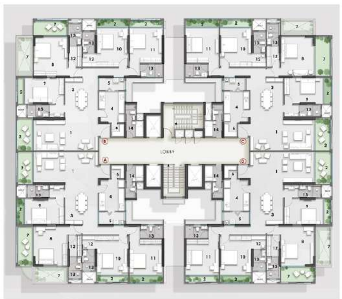
TYPICAL EVEN FLOOR PLAN

LEGEND: 1- LIVING ROOM, 2- DECK, 3- DINING, 4- KITCHEN, 5- UTILITY AREA, 6- STORE ROOM, 7- DOUBLE HEIGHT BALCONY AT ALTERNATE FLOORS, 8- MASTER BEDROOM, 9- GUEST BEDROOM, 10- BEDROOM 01, 11- BEDROOM 2, 12- DRESSER, 13- TOILET, 14- SERVICE AREA