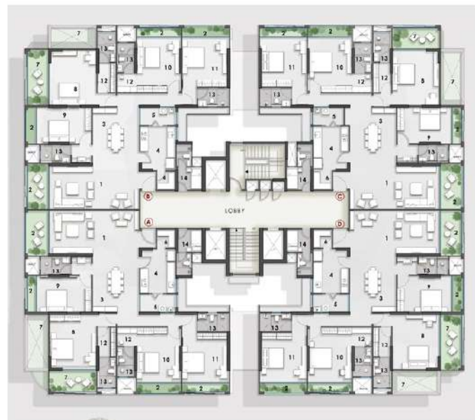
TYPICAL ODD FLOOR PLAN

LEGEND: 1- LIVING ROOM, 2- DECK, 3- DINING, 4- KITCHEN, 5- UTILITY AREA, 6- STORE ROOM, 7- DOUBLE HEIGHT BALCONY AT ALTERNATE FLOORS, 8- MASTER BEDROOM, 9- GUEST BEDROOM, 10- BEDROOM 01, 11- BEDROOM 2, 12- DRESSER, 13- TOILET, 14- SERVICE AREA