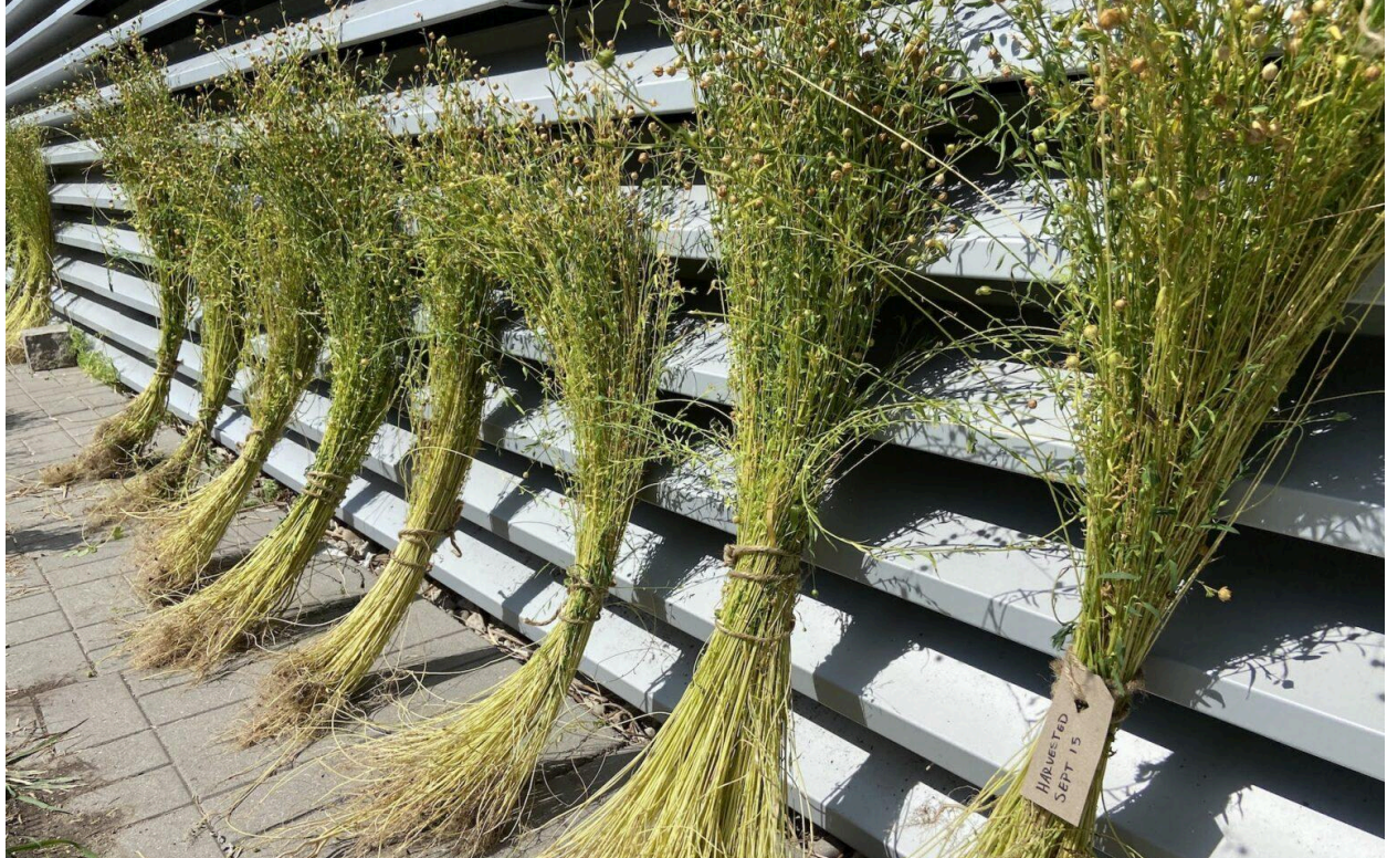
'The Flax Project', Flax bundles drying at TMU's Urban Farm.