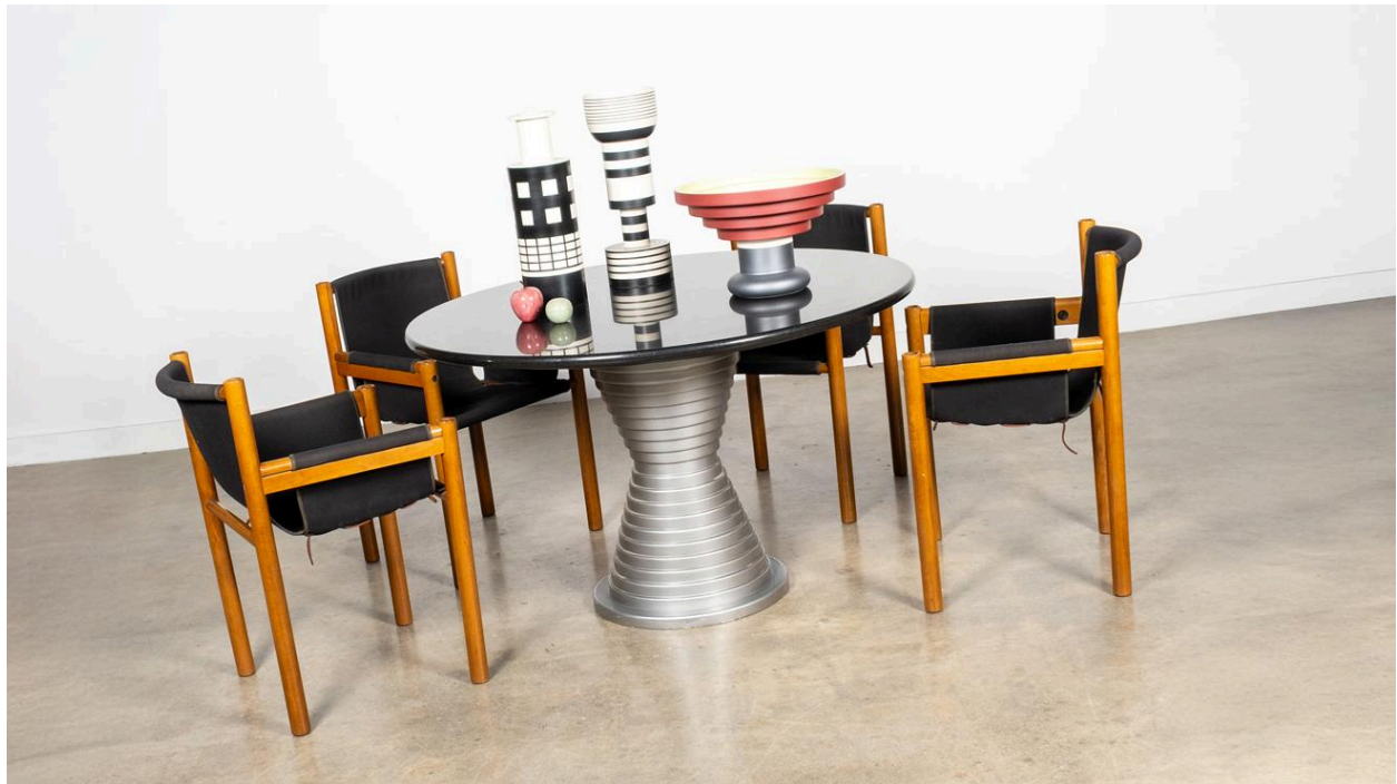
'La Dolce Design: Celebrating Italian Design, from Vintage Icons to Modern Masters', Vintage 1980s Marble Top Hourglass Base Dining Table and Set of 4 Sling Chairs by Ibisco, topped with a selection of Bitossi Ceramics by famed Italian Designer Ettore Sottsass.

Giraffe and HSPLUS present a curated takeover of The Adelaide Project by TPL Lighting, featuring live 3-D printing and a composed mix of lighting, furniture, and textiles. Two events invite designers and partners to explore how these elements integrate to shape contemporary interiors.