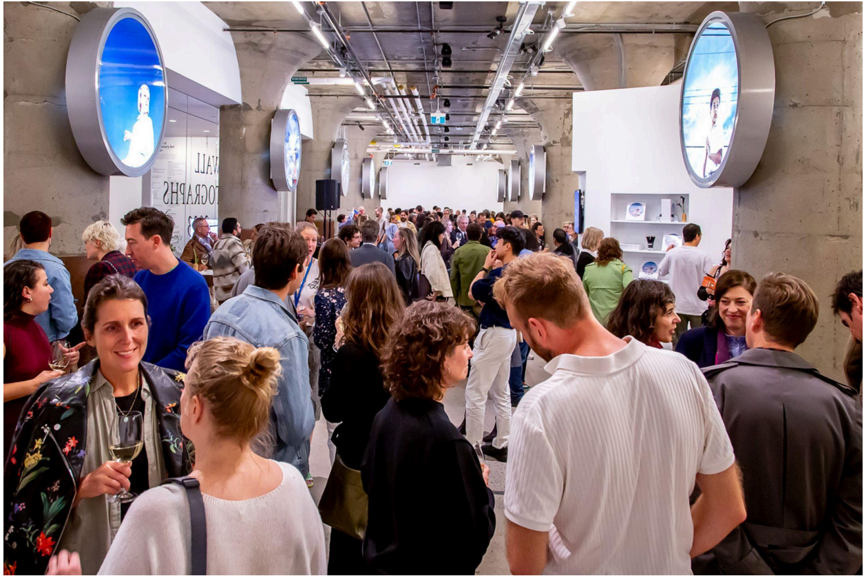
'Jeff Wall Photographs 1984–2023' public preview.

design-led initiatives addressing urban issues, while at ' DesignTO Tours: hollis+morris ' an A&D Breakfast offers a closer look at a Toronto-based studio known for material experimentation and local production.