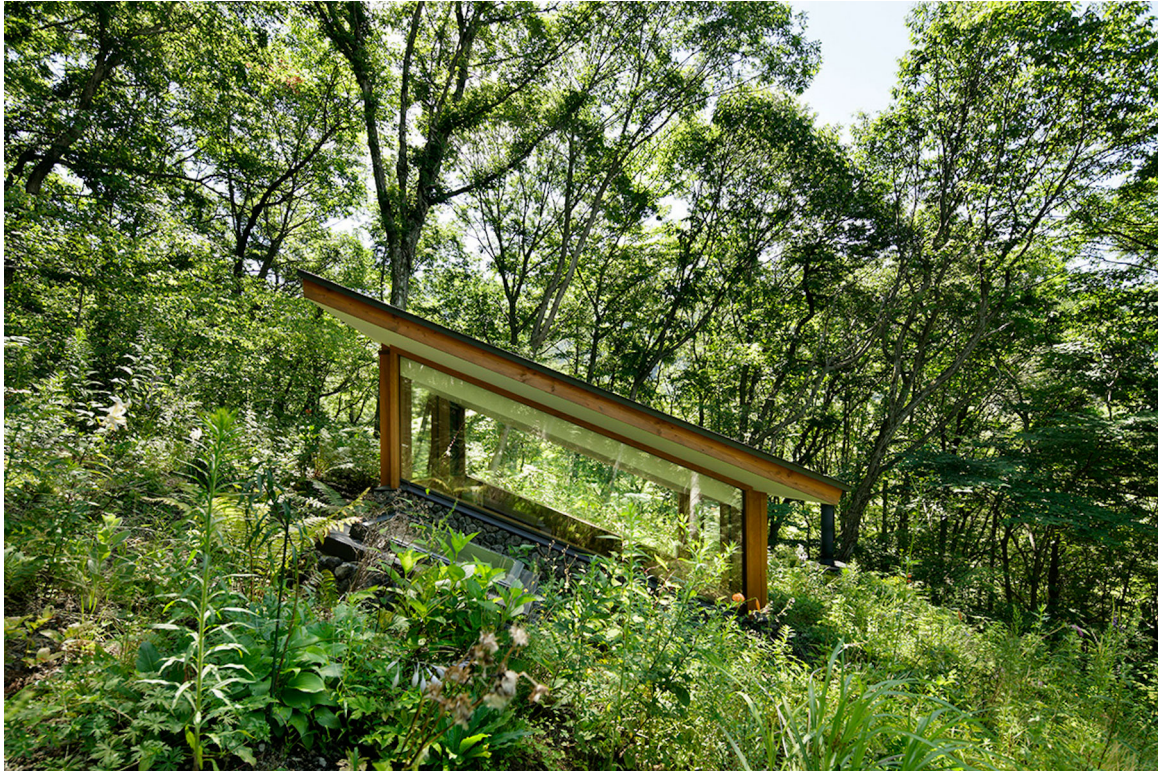
Cockpit House. Landscape Architecture by Hiroshi Nakamura & Nap en Japan.