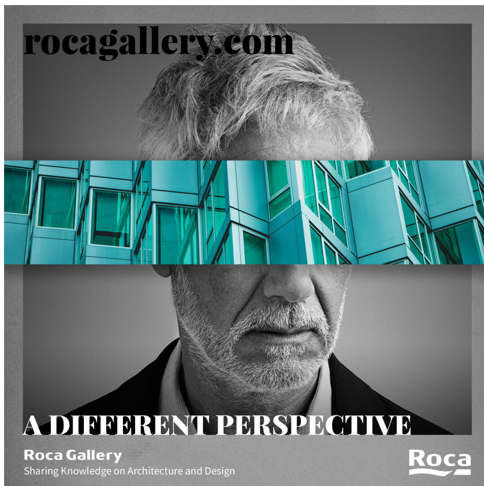
Picture of Roca Gallery graphic campaign.