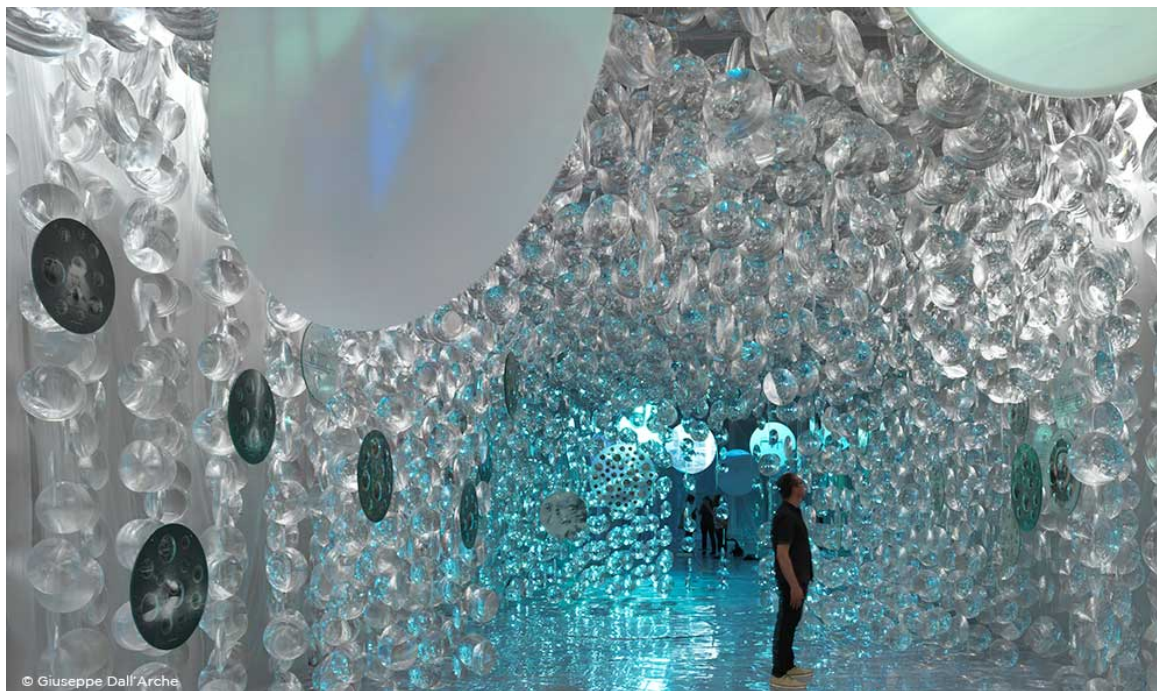
RCR. Dream and Nature Catalonia in Venice. Biennale di Venezia 2018.

Updated inspiration is a section that publishes recommendations and news items that are connected to the theme of the month and invite the user to go deeper into the subject, be it an event, or book or film .