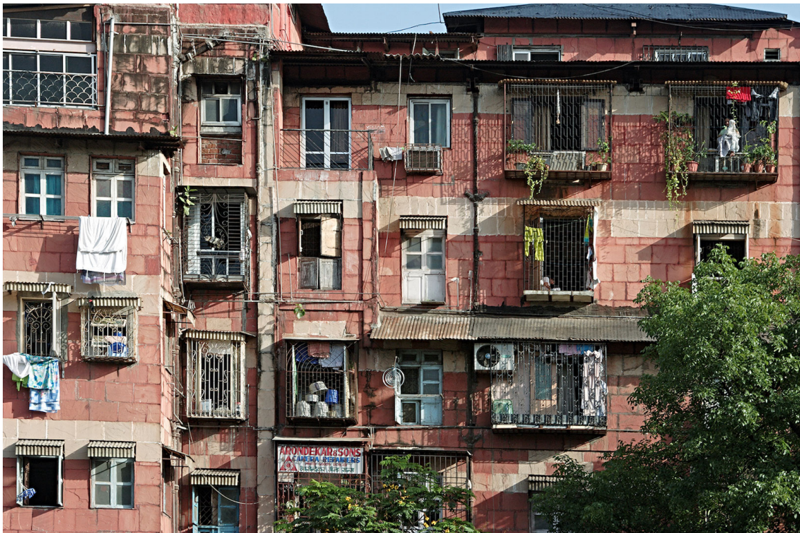
Many Windows, many worlds, and many lives. In front of the Chhatrapati Shivaji Railway Terminus .

Article: The Greening of Mumbai. Saket Sethi. #Urban versus Rural