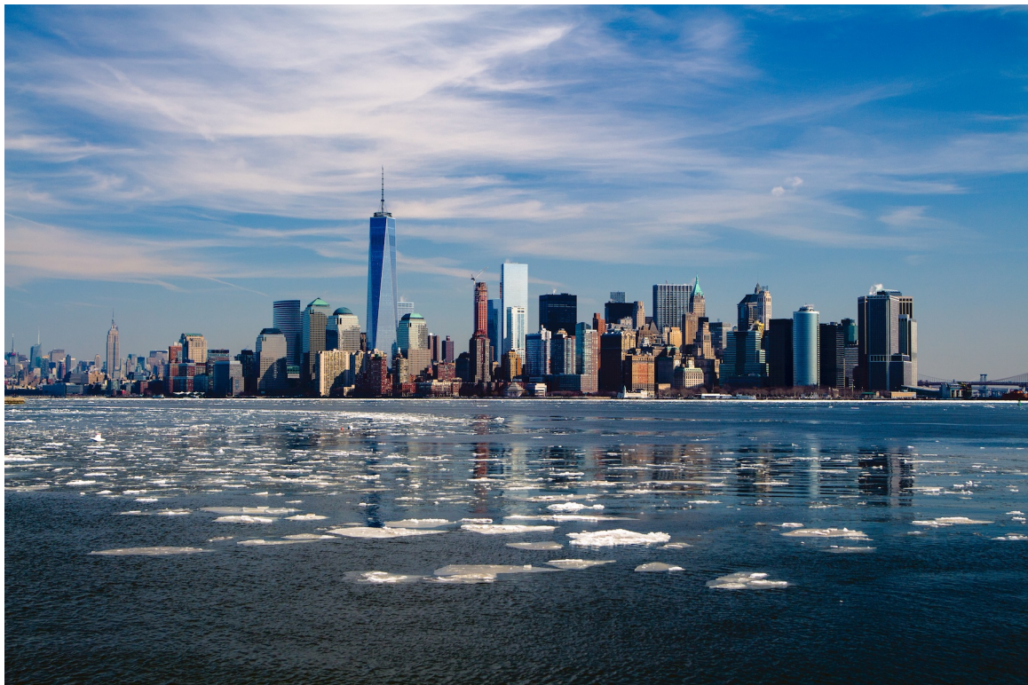
New York Skyline.

Beyond the green roof; architects treating the urban structure as landscape.