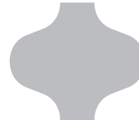
LANTERN 4.5 X 5.25"