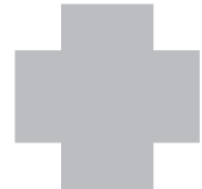
CROSS 4.5 X 4.5"