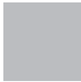
4" X 4"