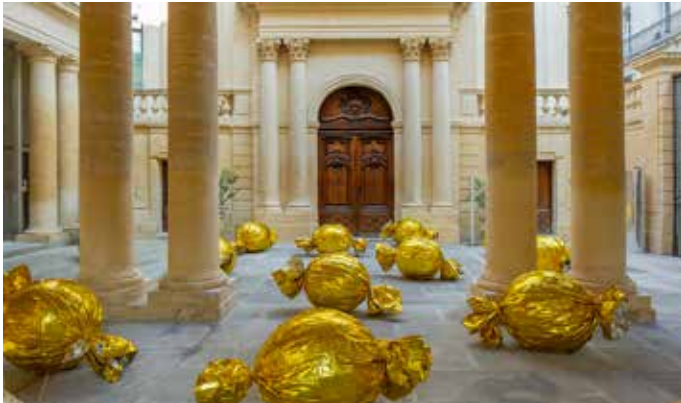
2025 : Portrait of a planet (UNIGE)