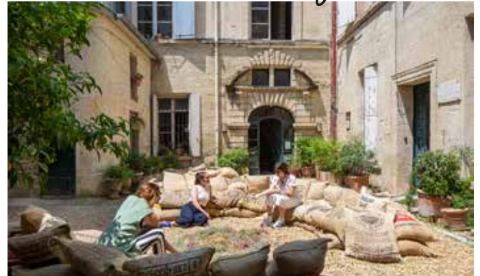
2025 : Food-waste futures (IAAC)

ReCITYing, a project co-founded by the European Union's Europe Programme, aims to create a networking and exchange platform for best practices in the temporary reuse of urban spaces. Targeting young creatives, professionals in architecture, design, and the arts, as well as local policymakers and social enterprises, this project promotes the regeneration of disused urban spaces and buildings into artistic laboratories and cultural incubators.