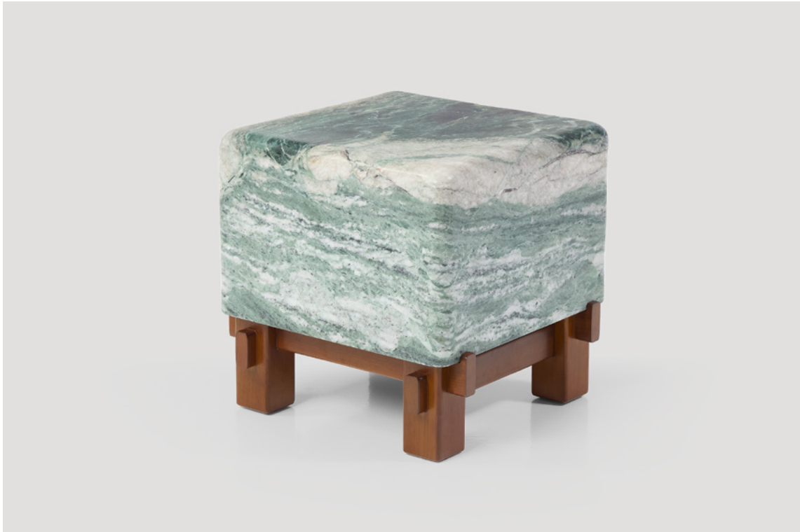
ASB 06 Puff