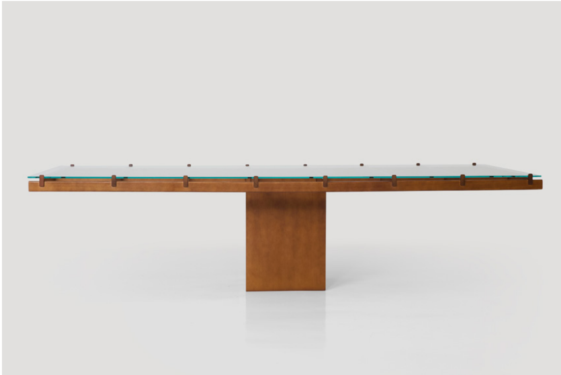
ASB 04 Dining table © Breton