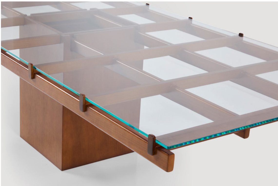
ASB 04 Dining table © Breton