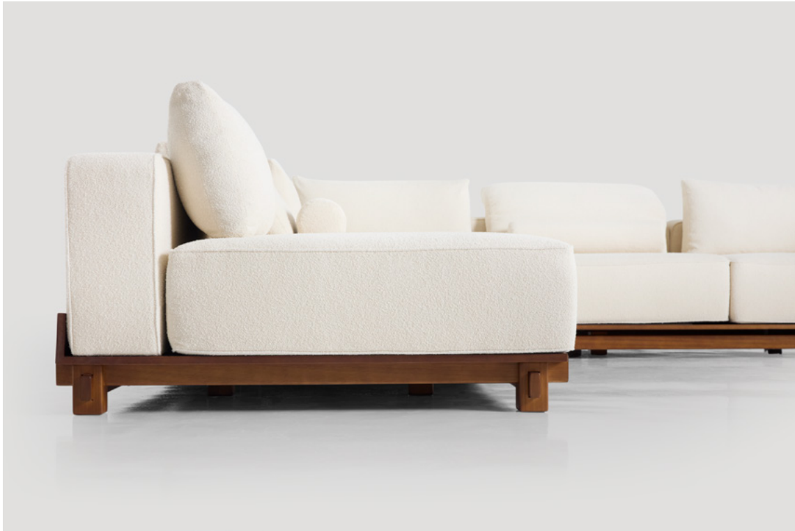
ASB 03 Sofa © Breton