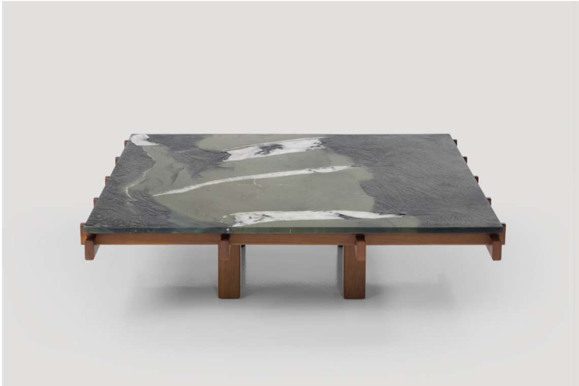
ASB 01 Coffee table © Breton