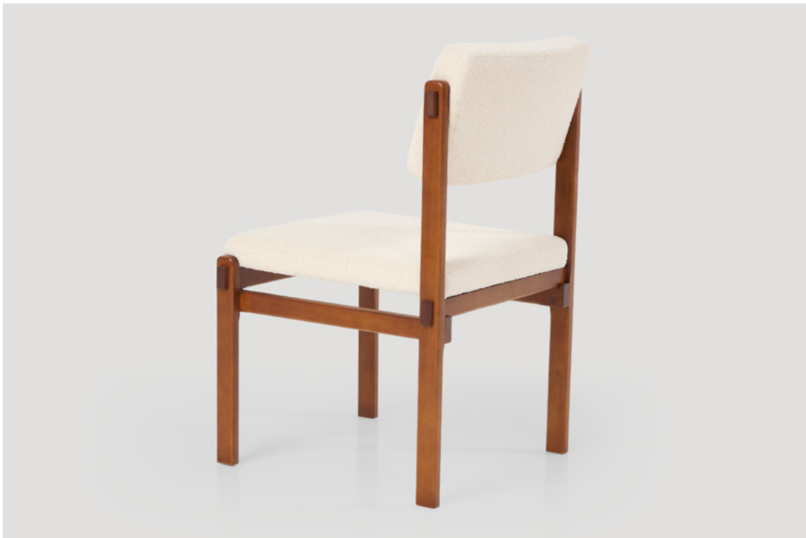
ASB 08 Chair