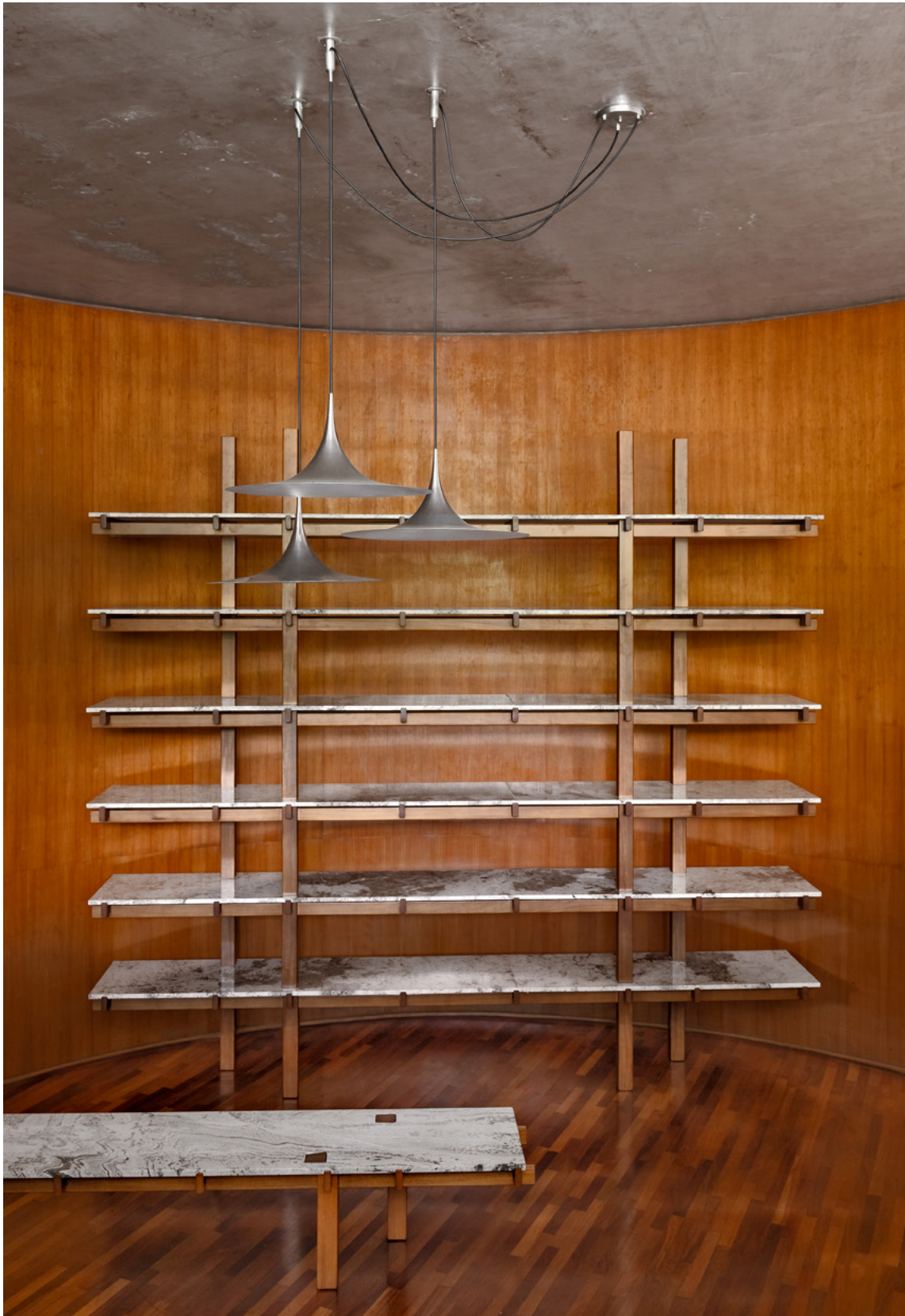
ASB 02 Bookshelf and ASB 05 Bench © Breton