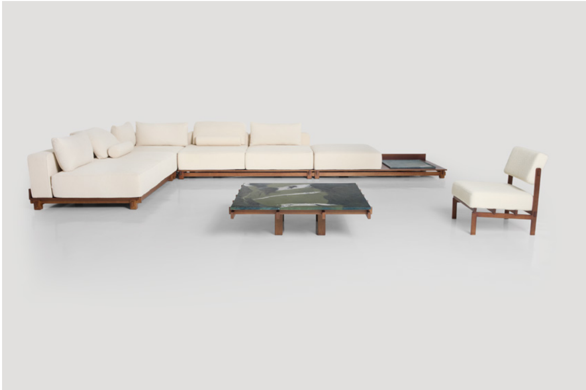
ASB 03 Sofa, ASB 01 Coffee table and ASB 07 Armchair © Breton