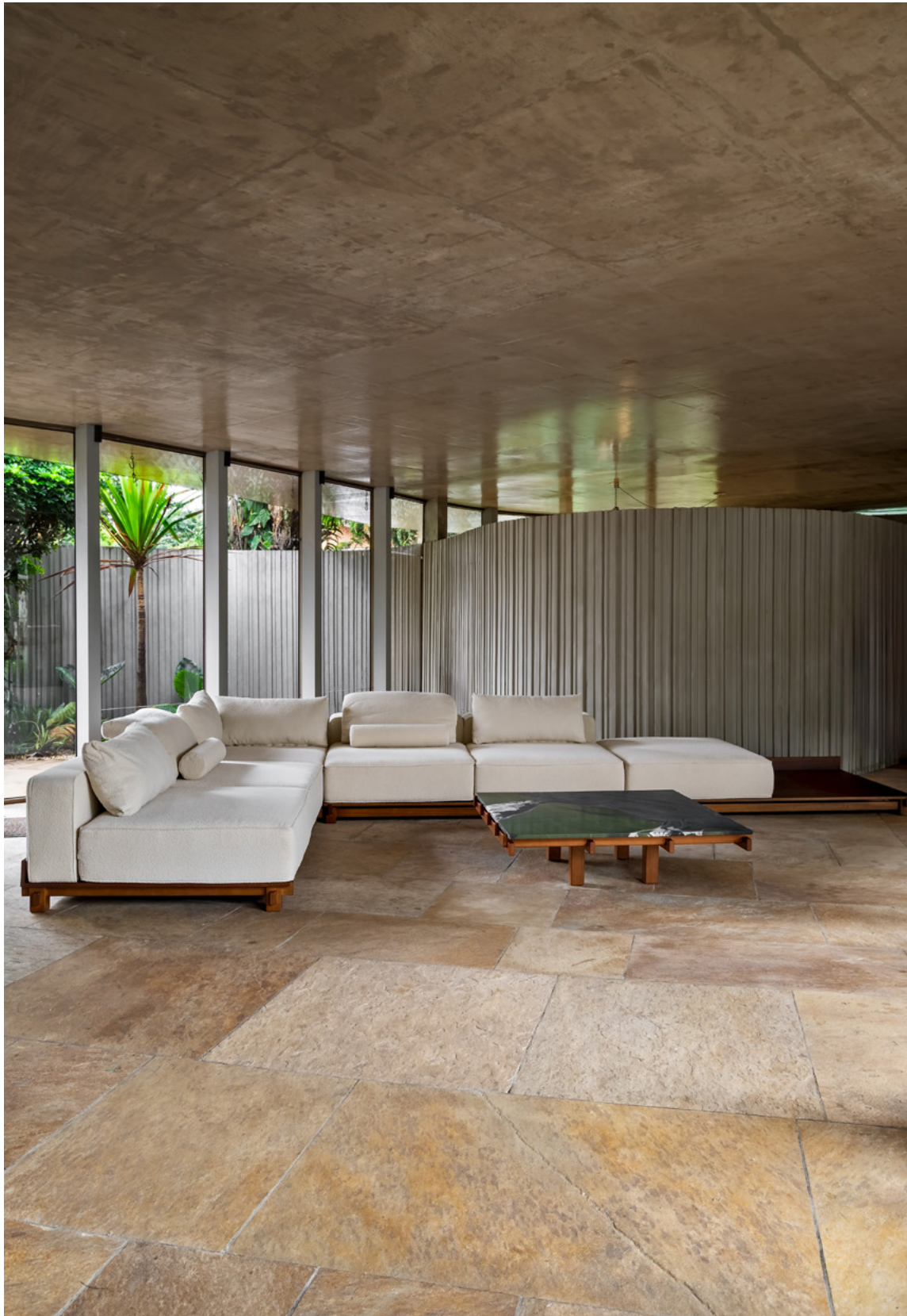
ASB 03 Sofa and ASB 01 Coffee table © Breton