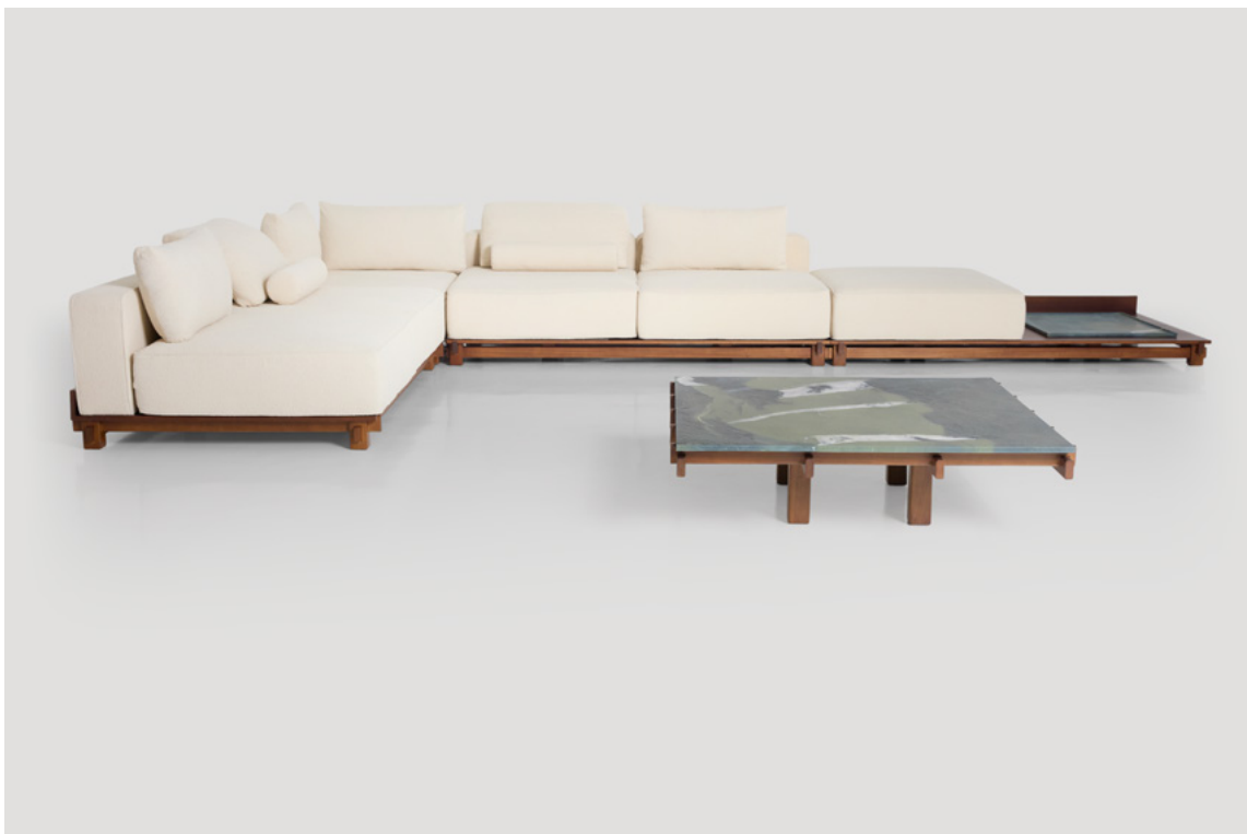
ASB 03 Sofa and ASB 01 Coffee table © Breton