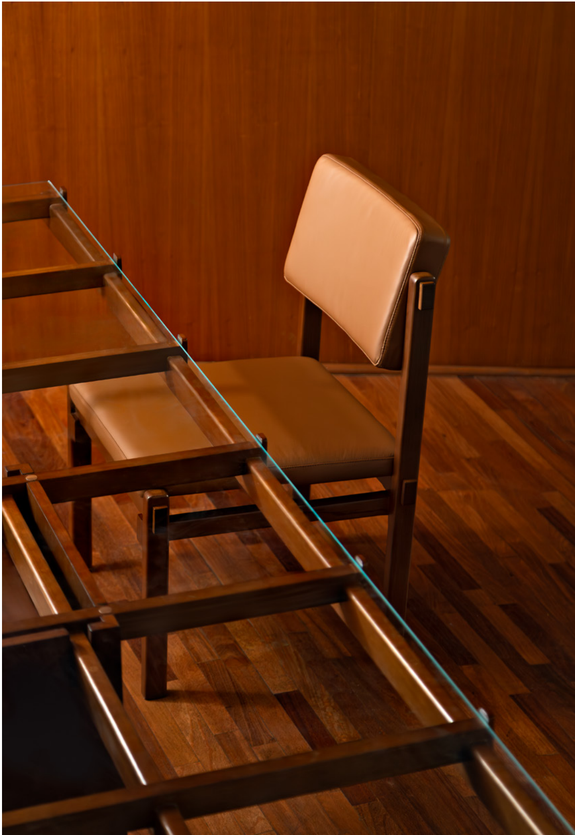
ASB 04 Dining table and ASB 08 Chair © Breton