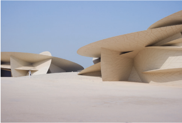
National Museum of Qatar by Jean Nouvel, Doha, Qatar.