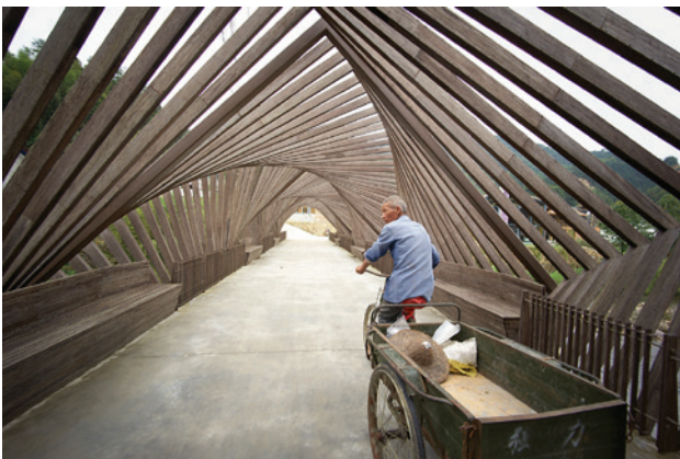
LIBAB – International Bamboo Biennale, Baoxi, China.