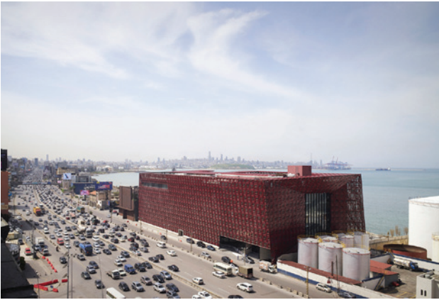
Aishti Foundation, Adjaye Associates, Beirut, Lebanon.