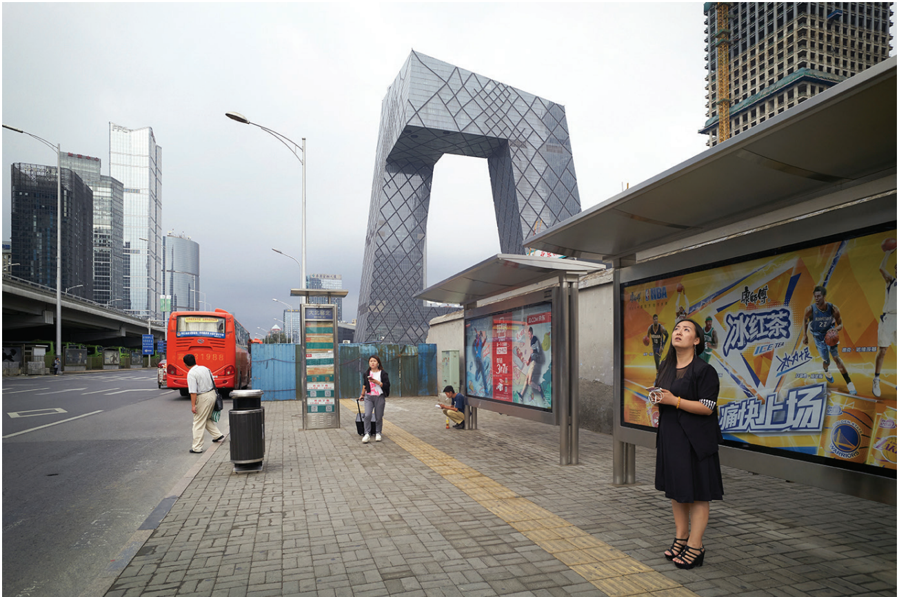
CCTV, OMA, Beijing, China.

'I perceive architectural photography as a way to capture a very specific moment of time, aspirations and problematics, the human condition. The spatial relationship between a user and his/her surroundings uncovers hidden stories and meanings, marking history at a single, specific instant of time. The builder, the passerby, the woman waiting at the bus stop: they are all unaware that they are protagonists ("incognito" figures) in that they are generating a new milieu.