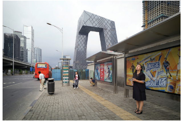
CCTV, OMA, Beijing, China.