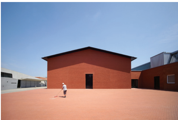
Schaudepot by Herzog and de Meuron, Weil am Rhein, Germany.