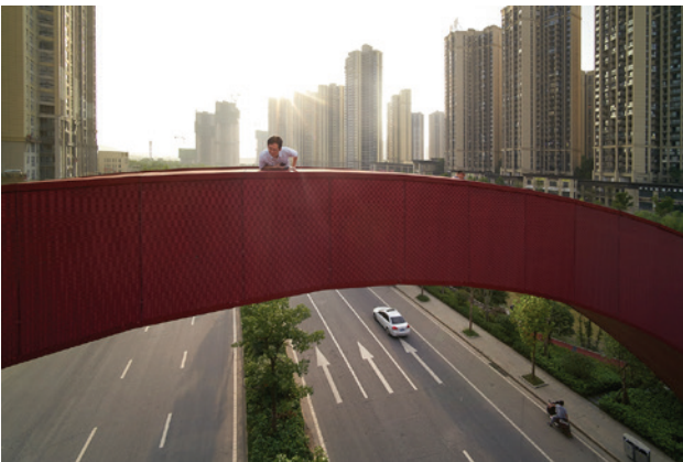
Lucky Knot Bridge by NEXT, Changsha, China.