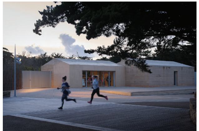
Welcome pavilion, TITAN, Saint-Vincent-sur-Jard, France.