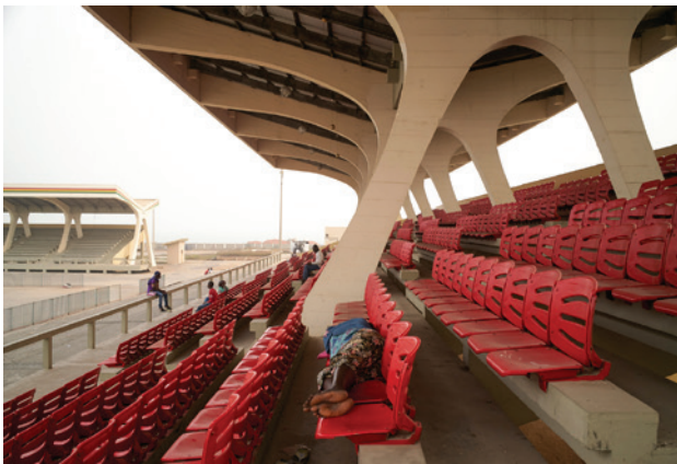
Black Star Square, Accra, Ghana.