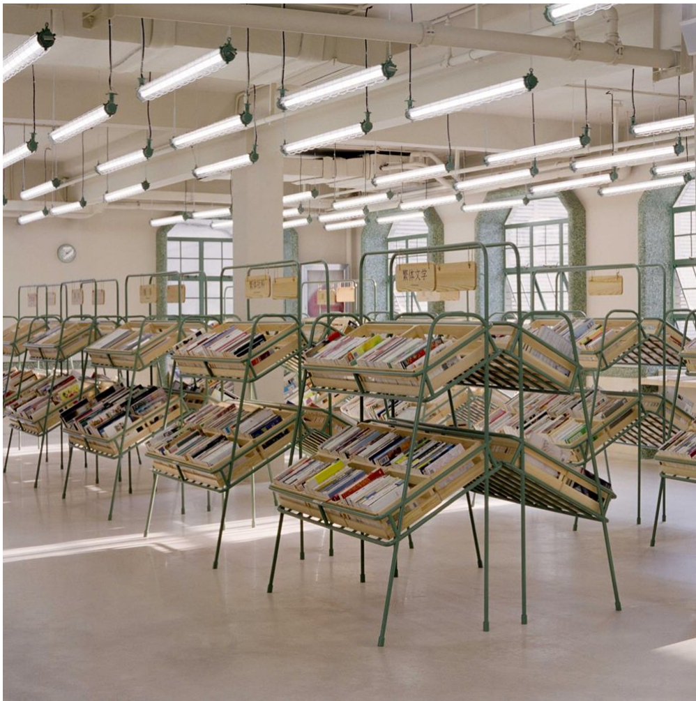
Above: Deja Vu Recycle Store by Offhand Practice.

Deja Vu Recycle Store designed by Offhand Practice is a second-hand bookshop located on the first and second floor of a three-storey building in Shanghai, China, which wins Large retail interior of the year . The local studio aimed to create a relaxed shopping environment by mimicking the experience of going to a supermarket. The clothes and books are displayed on shelves that resemble fruit and vegetable crates which the judges commended as "food for the mind! It's stripped back but in a confident way, exuding a calmness and thoughtful simplicity," they said.