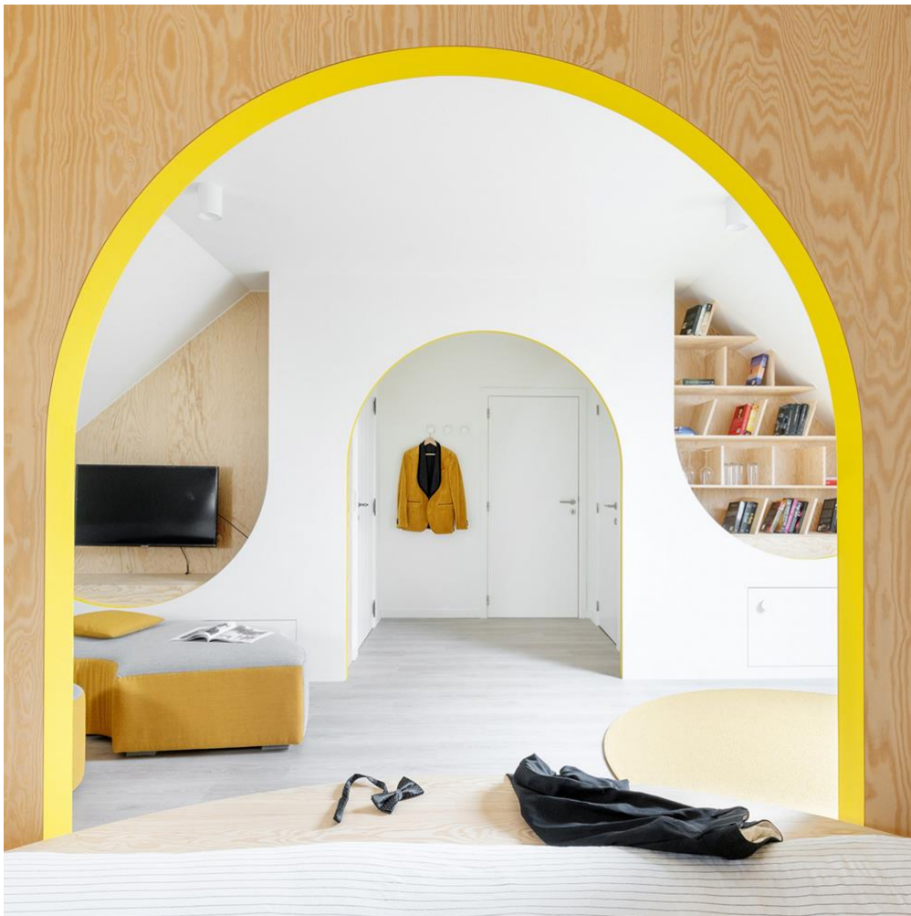
Above: Relaxing Geometry with Pops of Yellow by Van Staeyen Interieur Architecten.

Arched portals, curvy furniture and yellow decor accents feature in Van Staeyen Interieur Architecten's revamped attic project, Relaxing Geometry with Pops of Yellow in Antwerp, Belgium, wins Small interior of the year . The local studio refurbished a neglected attic in a family home, turning the area into a multi-functional space. "This is a good example of how design can be joyful and whimsical," commended the judges. "Accessible in many different aspects, financially and physically, it's not just a playground for kids but a playground for everyone."