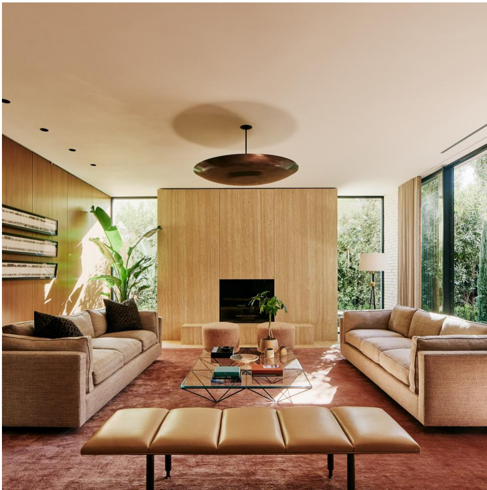
Above: Twentieth by Woods + Dangaran.

Twentieth is a three-storey house designed for a couple and their three young children in Santa Monica, United States by Woods + Dangaran. The living spaces are organised around a courtyard with a decade-old olive tree with a U-shape ground floor, creating space for living rooms on both sides of the courtyard. Winning House interior of the year , judges said Twentieth "demonstrates an admirable interplay between inside and outside and a good mix of different finishes and textures."