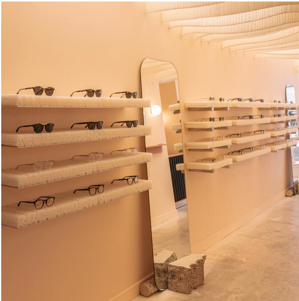
Above: MONC by Nina+Co.

London-based Nina+Co incorporated biomaterials and a circular approach to the design of eyewear brand MONC's debut store, winning Small retail interior of the year . Cornstarch-foam shelves and mycelium display plinths create a dialogue with the glasses, which are made from bio-acetate, a material that contains no fossil fuels. "This project demonstrates integrity between the finishes used and the product they are selling," commended the judges. "It is a very well executed retail interior with encouraging use of sustainable materials."