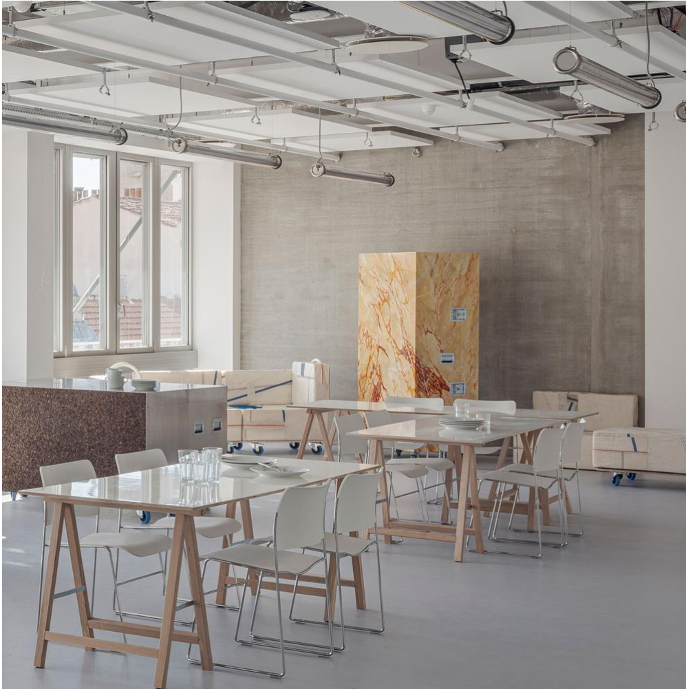
Above: Ecole Camondo Méditerranée by Émilieu Studio.