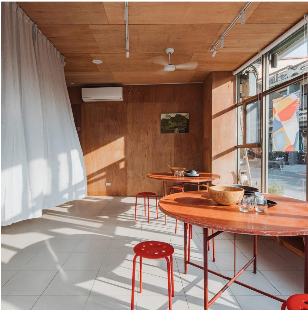
Above: The F.Forest Office by Atelier Boter.

Winner of Small workspace interior of the year , The F.Forest Office by Atelier Boter in Taiwan is a community centre situated in a fishing village. The building is designed as a hybrid dining, working and event space, which is loosely divided by a curtain. Judges found the project to be "very well embedded in its cultural context and, despite a small budget, the designers were able to create something beautiful and modern – a small jewel within an old fishing village."