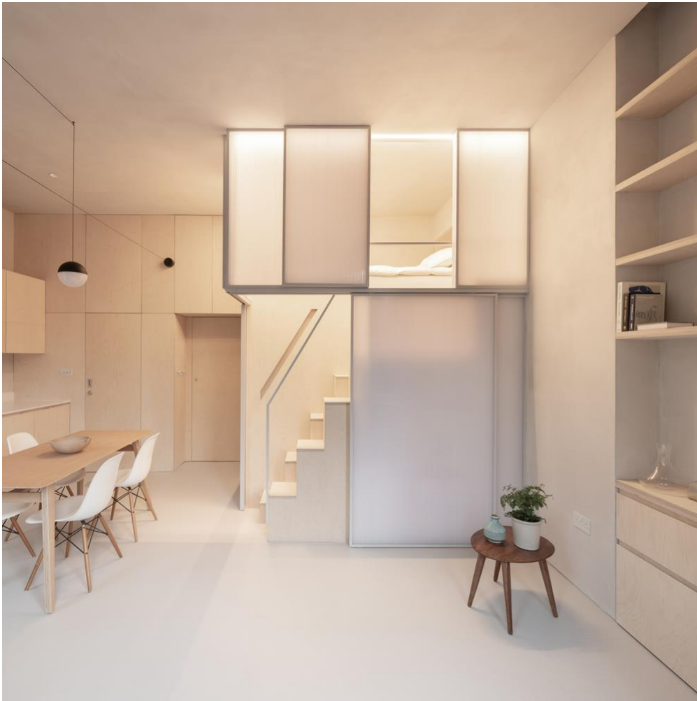
Above: Shoji Apartment by Proctor and Shaw.

Shoji Apartment, London, United Kingdom by Proctor and Shaw wins Apartment interior of the year . The project is a 29-square-metre micro-apartment that features birch plywood joinery throughout its interior. The apartment has an elevated sleeping area enclosed in translucent panels, which reference Japanese shoji screens and lends the project its name. "This is a highly innovative solution to the complexities of a challenging space that retains all the functionality of a normal apartment," said the judges.