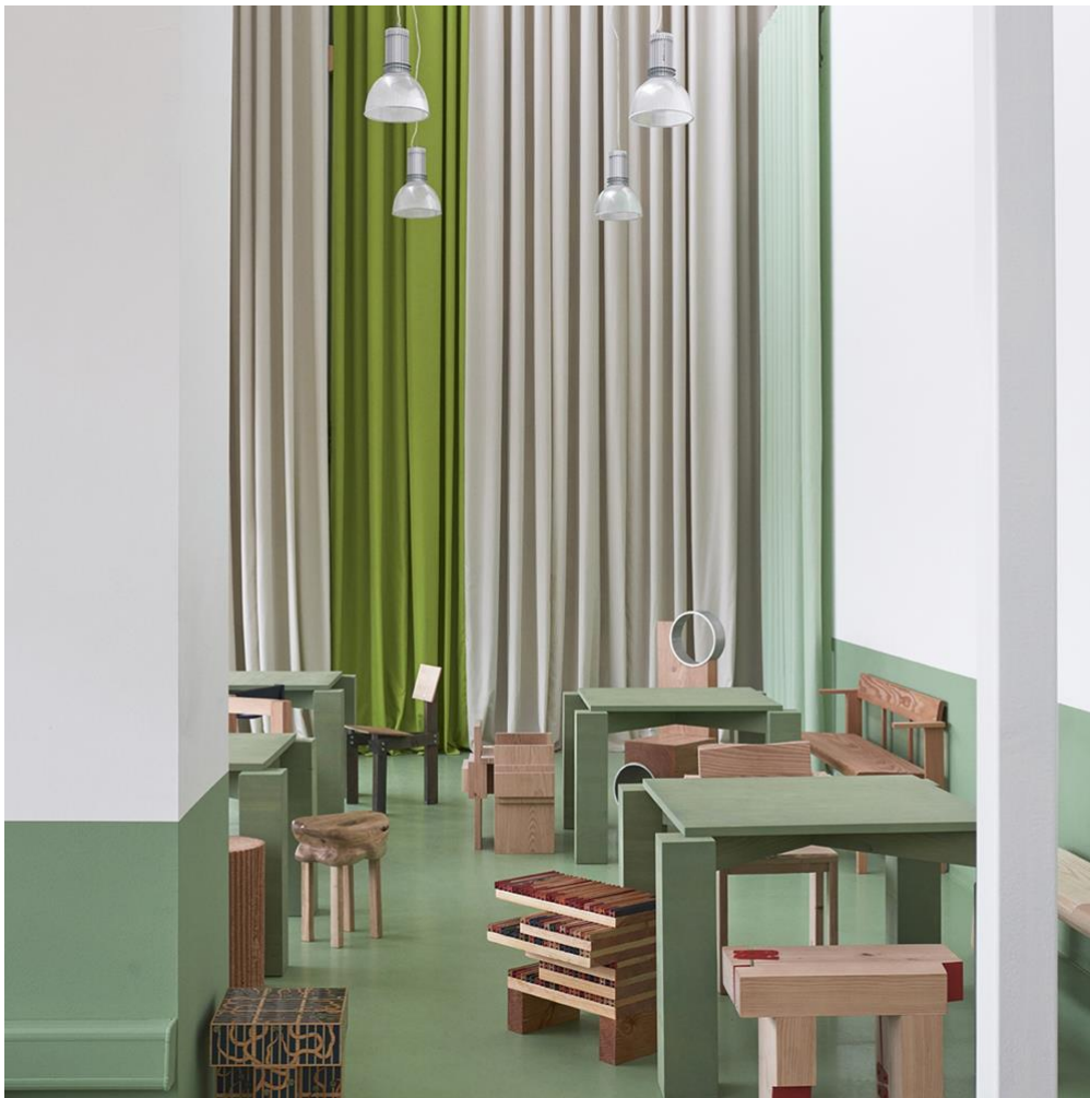
Above: Connie-Connie at Copenhagen Contemporary by Tableau and Ari Prasetya.

Connie-Connie at Copenhagen Contemporary in Copenhagen, Sweden, by Tableau and Ari Prasetya wins Restaurant and bar interior of the year . Connie-Connie is a cafe located within an international art gallery, a former welding facility. Tableau created the overall spatial design while Prasetya was responsible for the design and manufacturing of the bar, as well as several other furniture pieces made by 25 designers from offcut wood. "The project addresses everything we expect from an interior design today – not only does it connect on a physical level, it connects with the community," said the interiors panel.