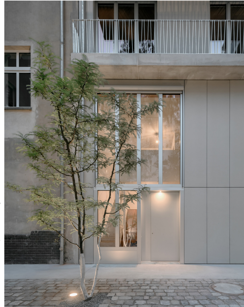
Facade Detail - Private entry to one of the groundfloor maisonnetts.