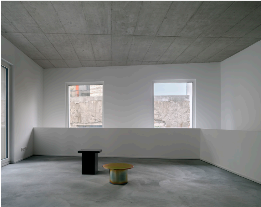
On the gallery of one of the garden maisonettes.