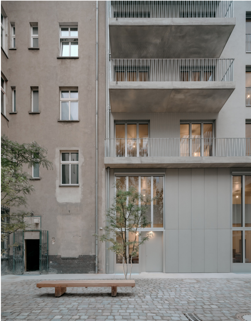
Old and new create an atmosphere.