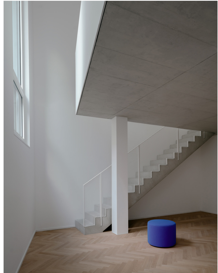
Many spatial sequences were developed in section.