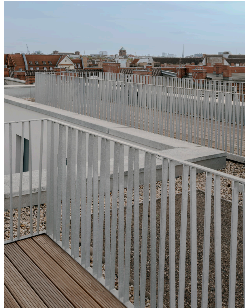
Rooftop terrace over the berlin skyline.