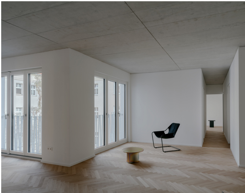
Signs of craftsmanship give the dwellings something intrinsic.