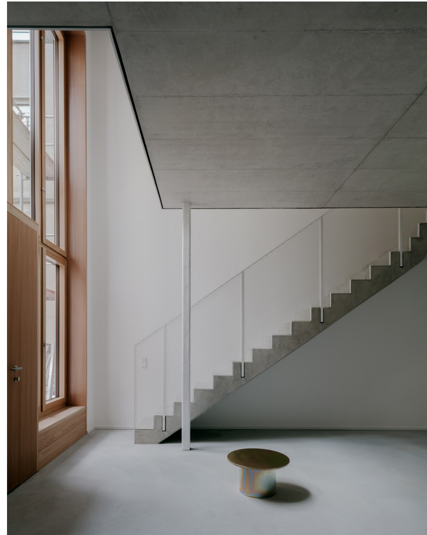
Maisonette apartments on groundfloor around the central courtyard with 6.5m high windows.