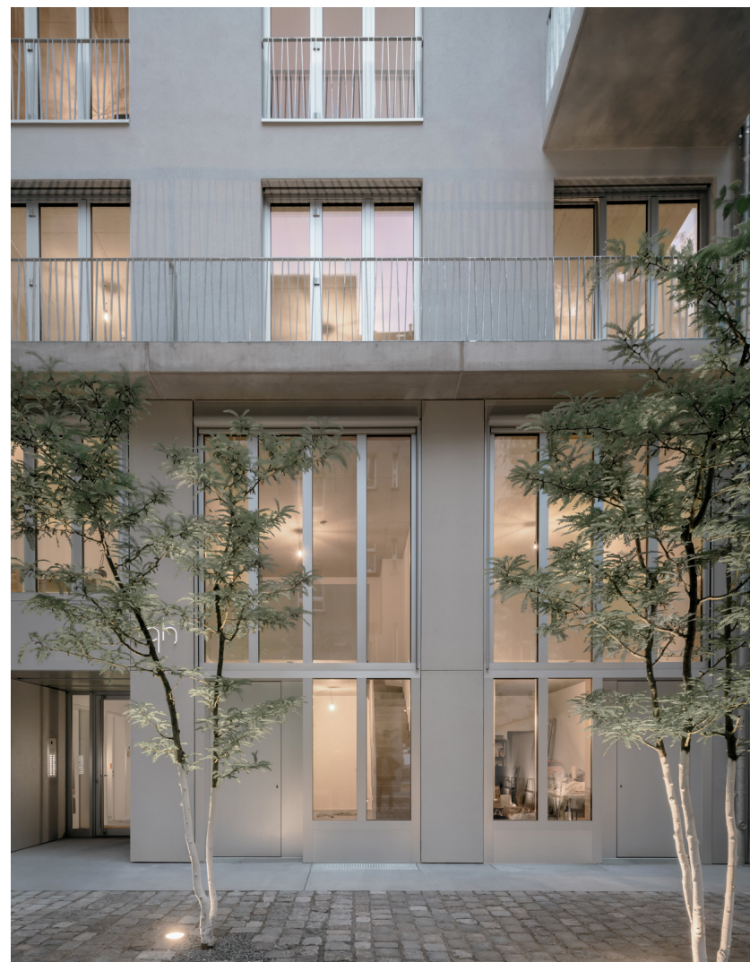
Facade Material - Composition of rough and elegant materials that age gracefully.