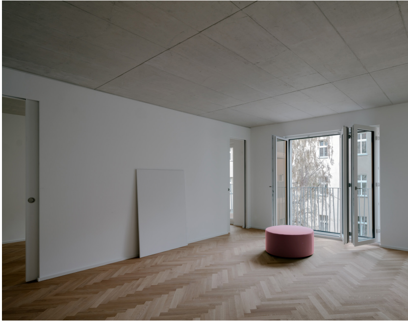
Oak floors and exposed concrete ceilings showcase fine craftsmanship.