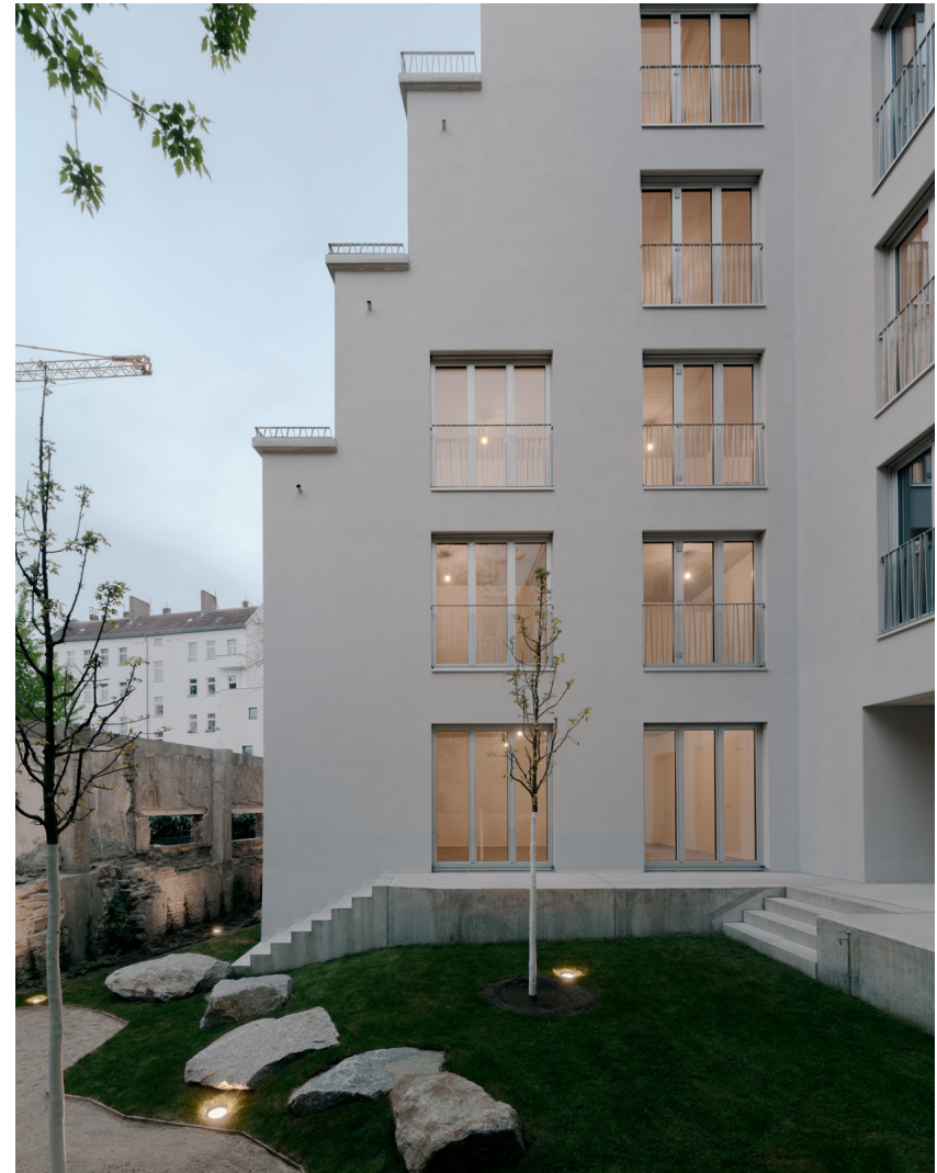
Setbacks of the facade in the last courtyard.