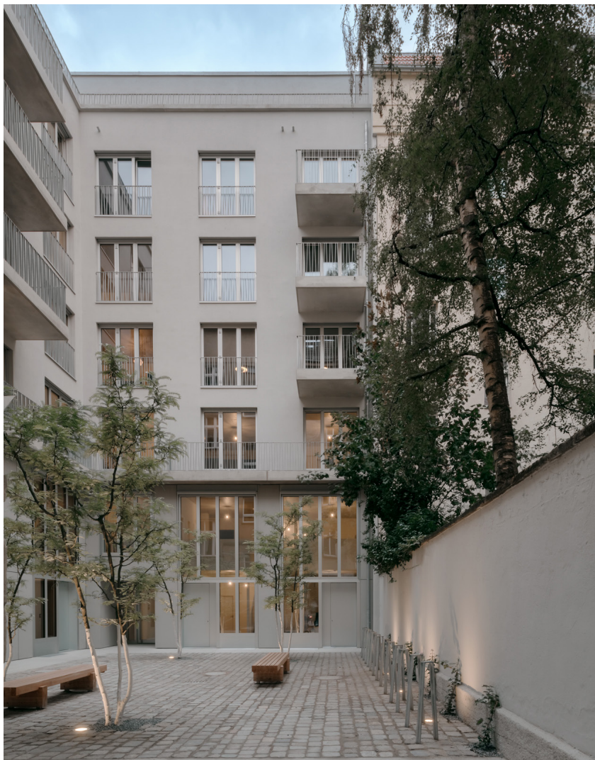
The central courtyard.