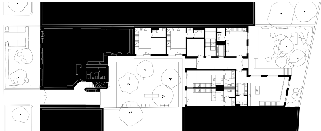
Groundfloor - Sequence of courtyards between existing and the new building.