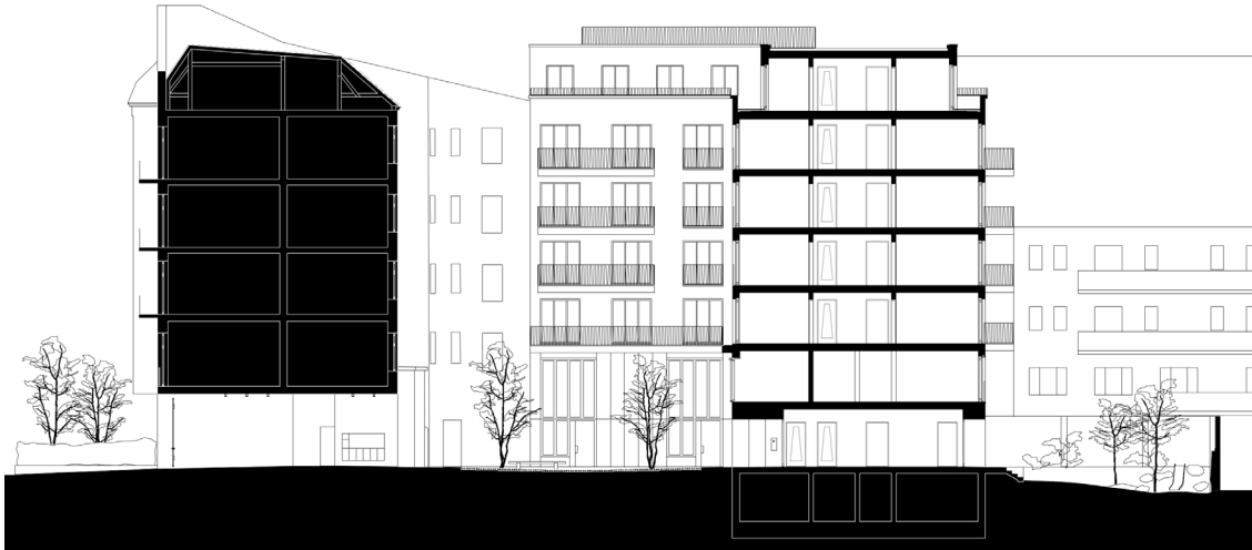
Section - Sequence of courtyards between existing and the new building.