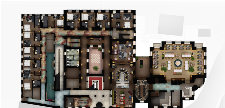
BWM_Bad Gastein_Grand Hotel Straubinger_groundfloor © BWM_Designers & Architects