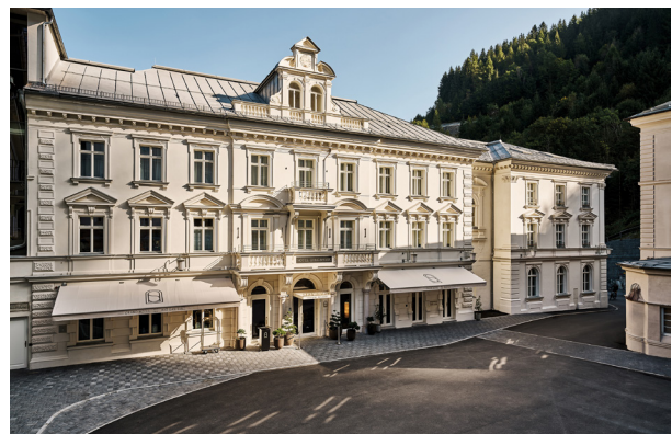
BWM_Bad Gastein_Grand Hotel Straubinger_Facade