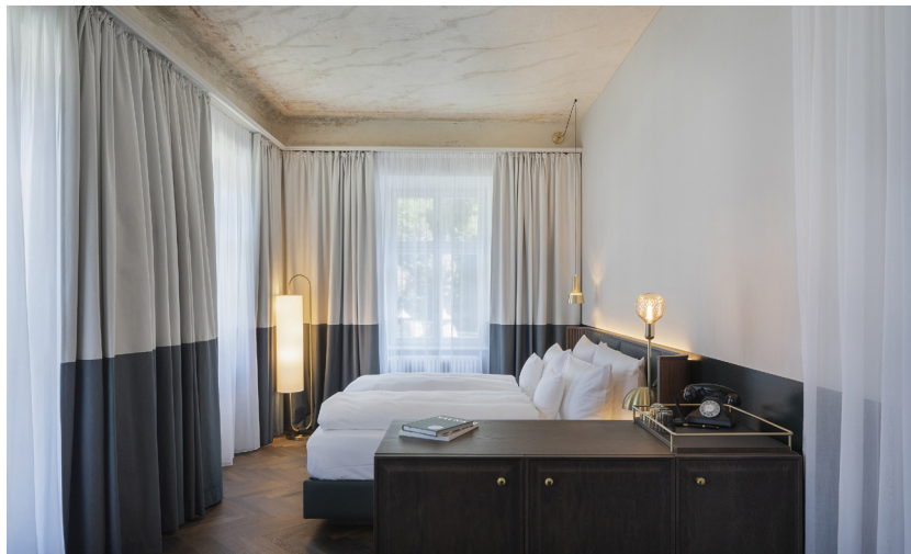
BWM_Bad Gastein_Grand Hotel Straubinger_Suit02 ©BWM_Designers & Architects