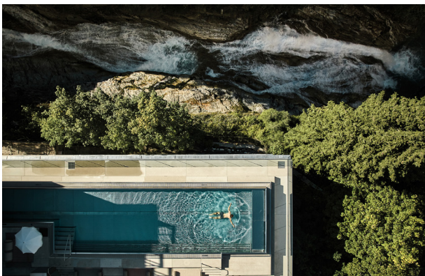
BWM_Bad Gastein_Grand Hotel Straubinger_Spa Pool 00