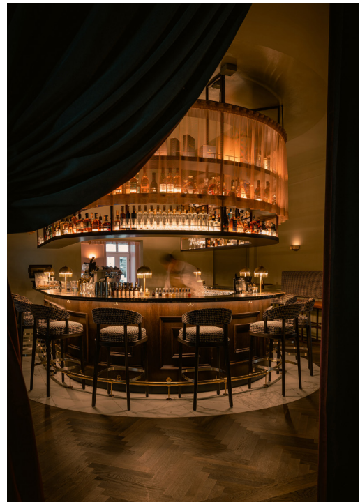
BWM_Bad Gastein_Grand Hotel Straubinger_ Bar