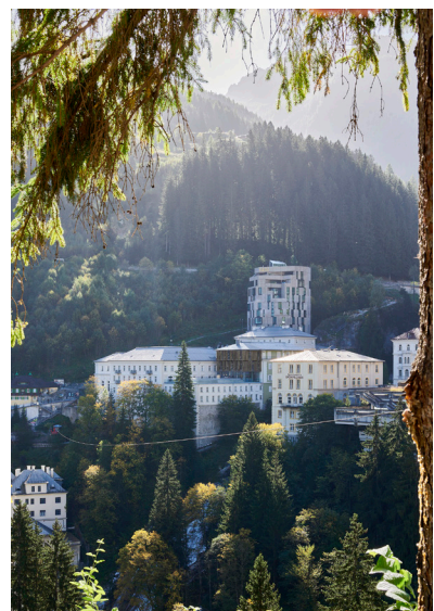
BWM_Bad Gastein_Hotelensemble_01 ©BWM_Designers & Architects_Lukas Schaller