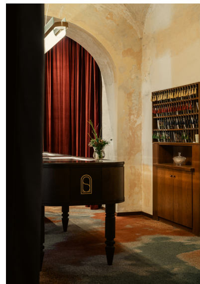
BWM_Bad Gastein_Grand Hotel Straubinger_Reception01_©BWM_Designers & Architects_ Ana Barros