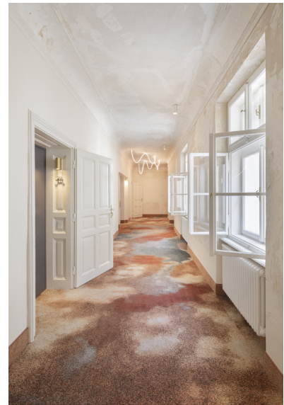
BWM_Bad Gastein_Grand Hotel Straubinger_Corridor_©BWM_Designers & Architects