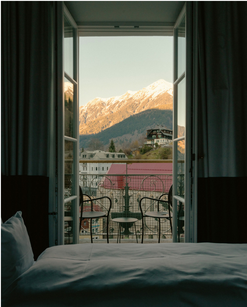
BWM_Bad Gastein_Grand Hotel Straubinger_Suite View