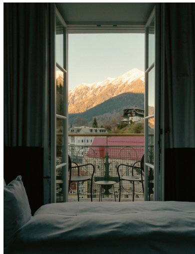
BWM_Bad Gastein_Grand Hotel Straubinger_Room Detail_02 ©BWM_Designers & Architects Ana Barros