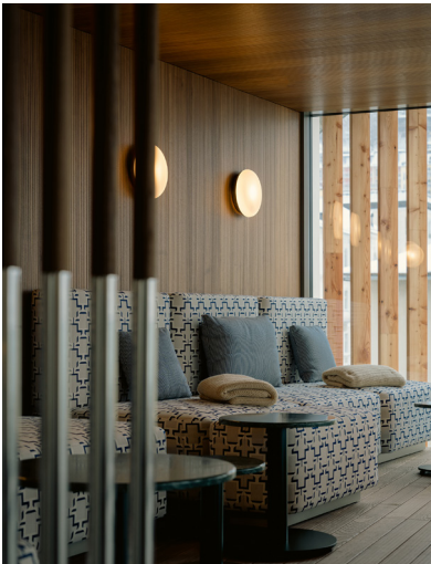
BWM_Bad Gastein_Grand Hotel Straubinger_Spa02 ©BWM_Designers & Architects_Ana Barros