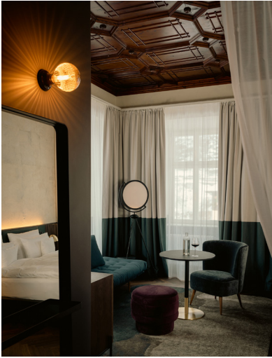
BWM_Bad Gastein_Grand Hotel Straubinger_Pine Suite01 ©BWM_Designers & Architects Ana Barros