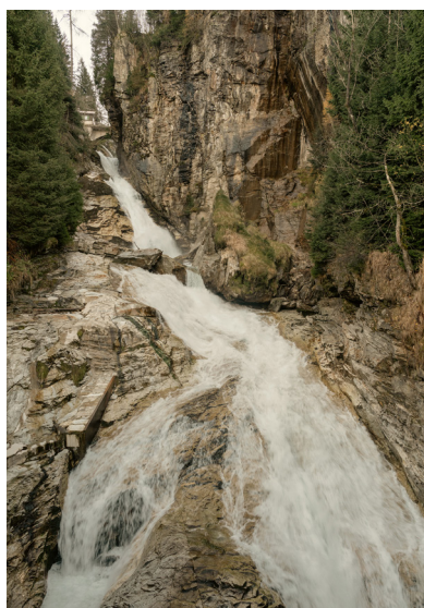
BWM_Bad Gastein_Waterfall_ ©BWM_Designers & Architects_Ana Barros