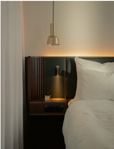
BWM_Bad Gastein_Grand Hotel Straubinger_Room Detai 01_ ©BWM_Designers & Architects _ Ana Barros