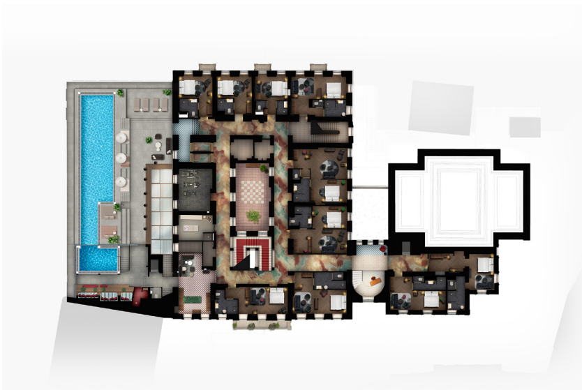
BWM_Bad Gastein_Grand Hotel Straubinger_first-floor © BWM_Designers & Architects