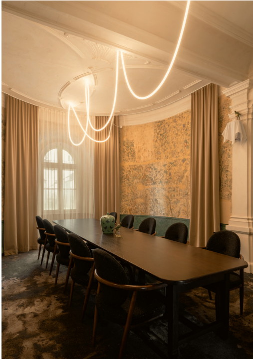
BWM_GrandHotelStraubinger_ PrivateDining_©BWM_DesignersArchitects_ AnaBarros