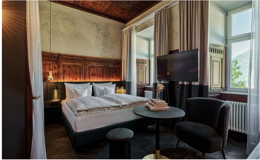
BWM_Bad Gastein_Grand Hotel Straubinger_Pine Suite 02_ ©Arne Nagel_AMOAeK