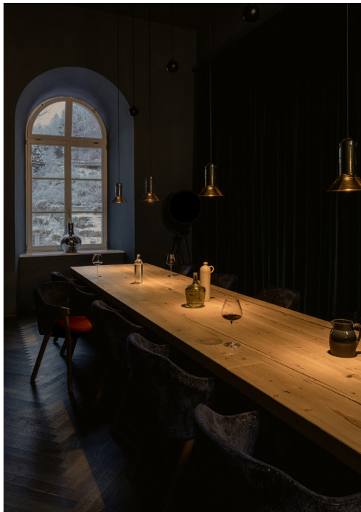
BWM_GrandHotelStraubinger_ ChefsTable_©BWM_DesignersArchitects_ AnaBarros