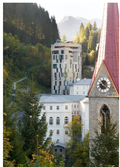
BWM_Bad Gastein_Hotelensemble_02