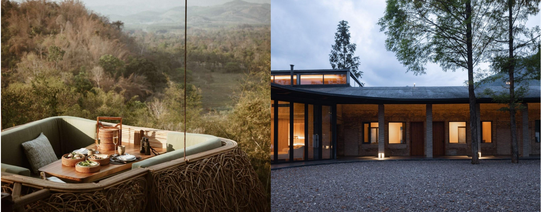
Photo credit from upper left: FOREST, Studio 40. Layen Life by Anantara, Tierra Design. Kempinski Hotel San Lorenzo Malta, Living Design of Sweden AB. The Usual Rotterdam, J_OI-Design IAD joehnik + partner mbB. Blending Arabesque Details with Luxury and Nature, Wilson Associates. Supalai Icon Sathom, dwp | design worldwide partnership.

Prize: Architectural Design of the Year - Eating Space